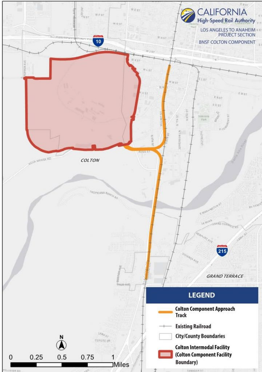
Figure D Colton Component