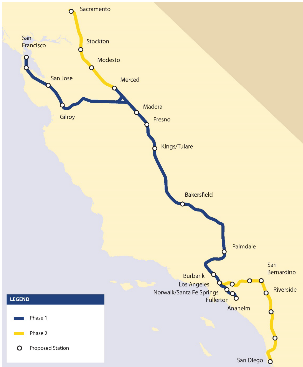
Figure A California High-Speed Rail System Preferred Alignments and Stations Statewide