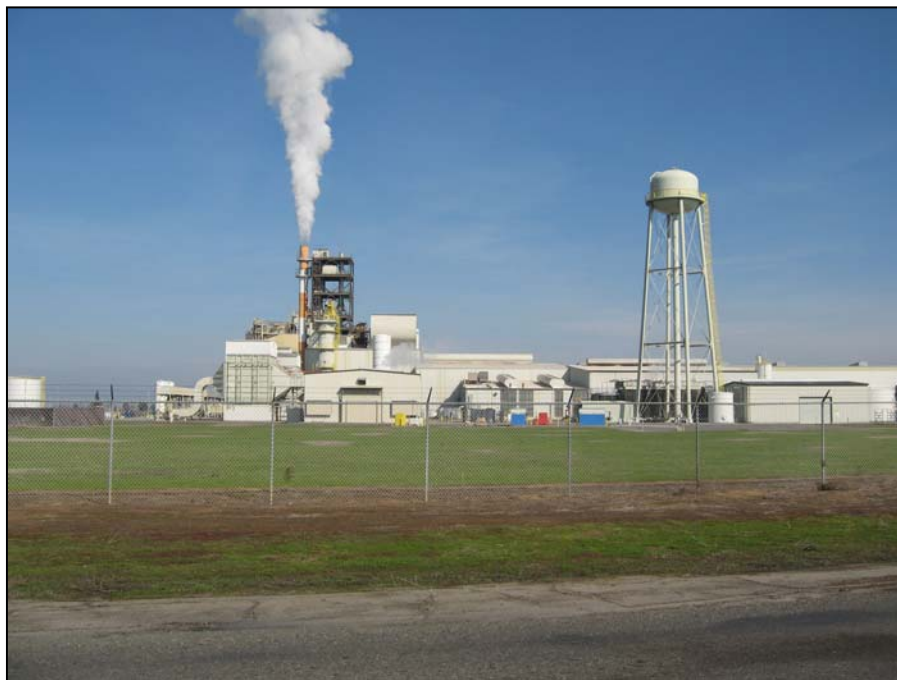
Figure 3: CertainTeed Plant Photo

CertainTeed operates a fiberglass insulation manufacturing and distribution facility at 17775 Avenue 22 ½. Noise sources associated with the facility are located in two primary regions of the facility. Manufacturing of insulation occurs on the west end of the building, which includes the plants primary mechanical equipment such as cooling towers, exhaust stacks, and raw material deliveries. Shipping and loading docks are located on the east end of the building where trucks enter/exit through the main entrance to the south of the property. CertainTeed estimates that an average of 100 trucks per day access the facility for shipping purposes. The facility is operated continuously year-round, 24 hours a day. Noise measurements were conducted outside the western and southern property lines. The west end of the building generated an average noise level of 49.3 dB Leq and a maximum noise level of 52.4 dB Lmax, at a distance of 900 feet. The South side of the building generated an average noise level of 58.1 dB Leq and a maximum noise level of 60.2 dB Lmax, at a distance of 900 feet. Figure 3 shows a photo of the west end of the facility taken from the south looking north.