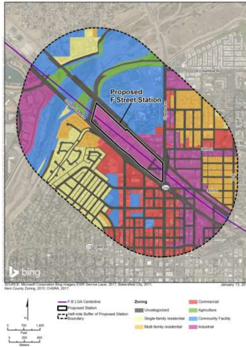
Exhibit GENERAL-05.1: High-Speed Rail Station Area Plan - Study Area Map