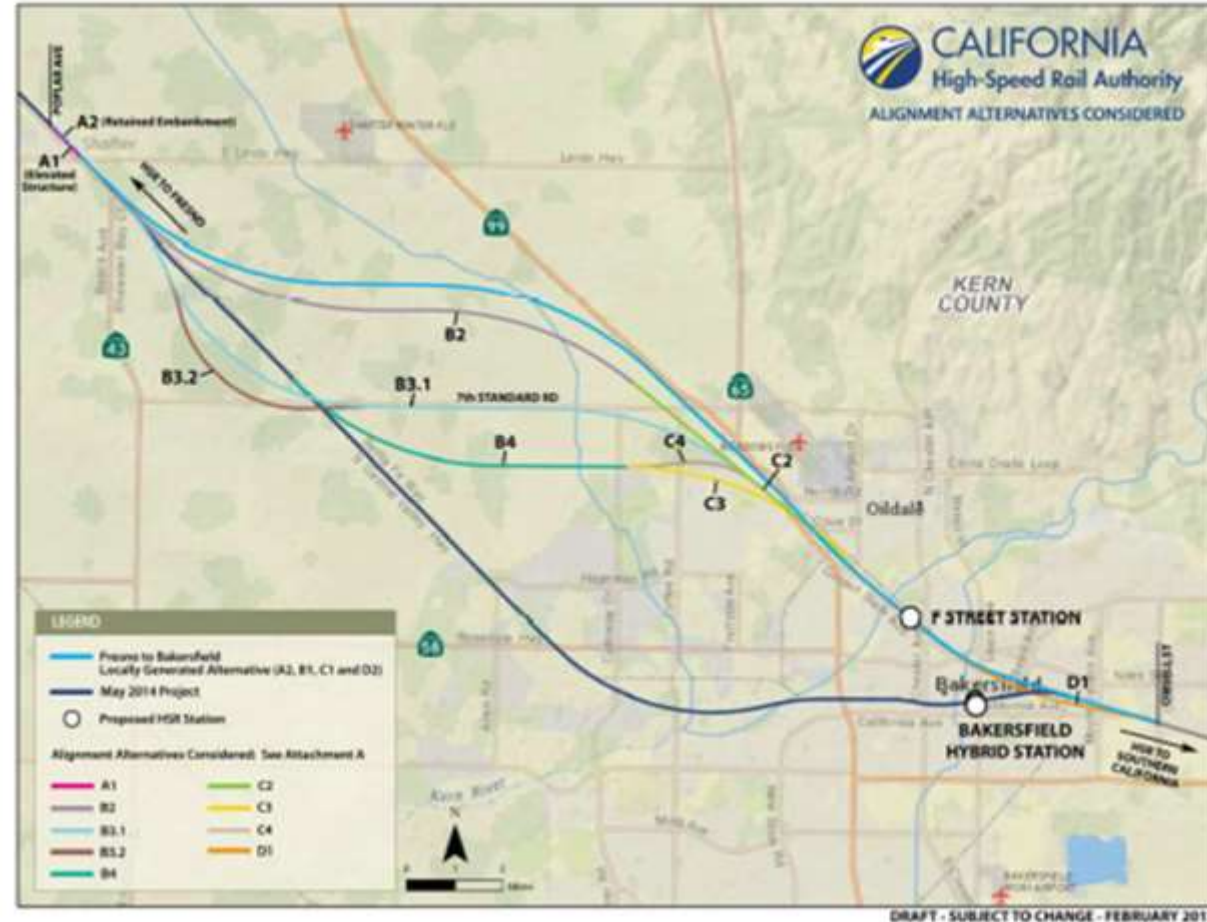
Exhibit GENERAL-01.1: F-B LGA Alignment Alternatives Considered

The Bakersfield West Alignment was previously eliminated in the Statewide Program Final EIR/EIS (see Figure 2.6-24 of the 2005 Statewide Program Final EIR/EIS and the subsequent table), and it included a spur connection to Bakersfield Amtrak Station and a station and MOIF near 7th Standard Road within the Bidart Brothers' Saco Ranch site. These design concepts did not satisfy HSR