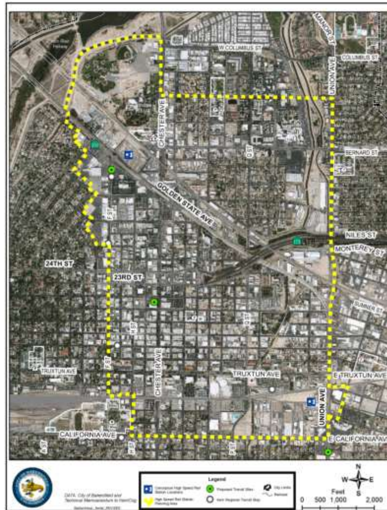
Exhibit GENERAL-05.2: High-Speed Rail Station Area Plan - Study Area Map