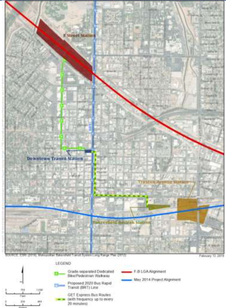
Exhibit GENERAL-05.3: F-B LGA and May 2014 Project Station Areas