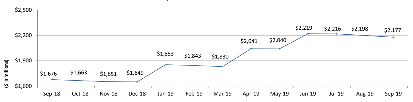
-Cap and Trade Monthly Expenditures