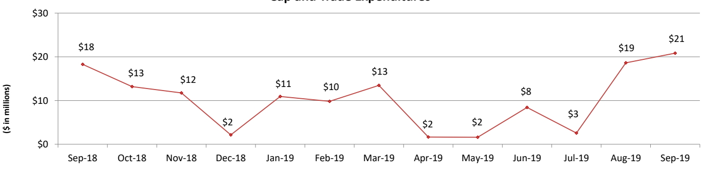
→Cap and Trade Monthly Expenditures