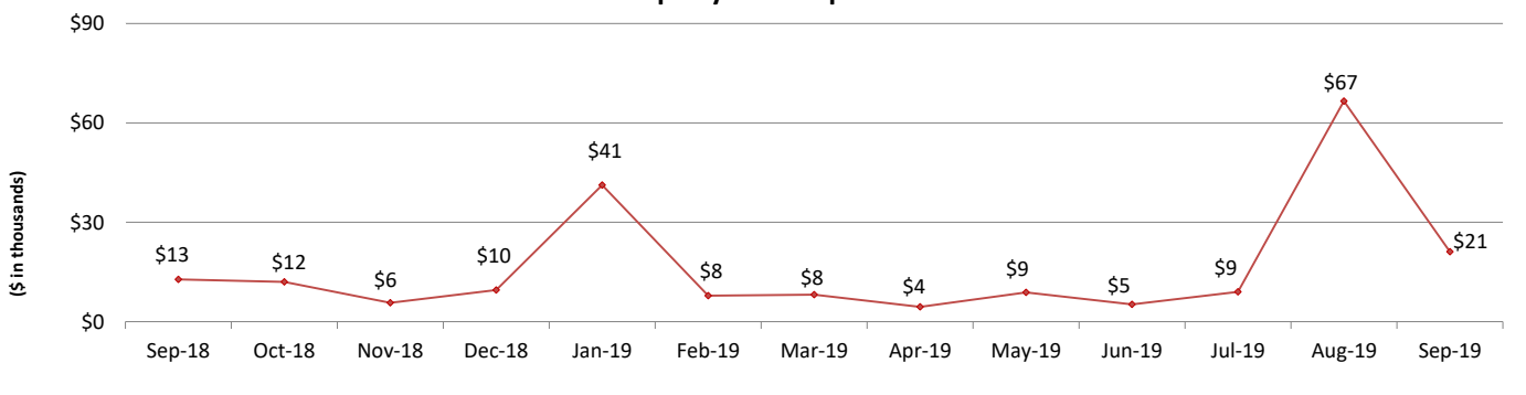
→ Rail Property Fund Monthly Expenditures