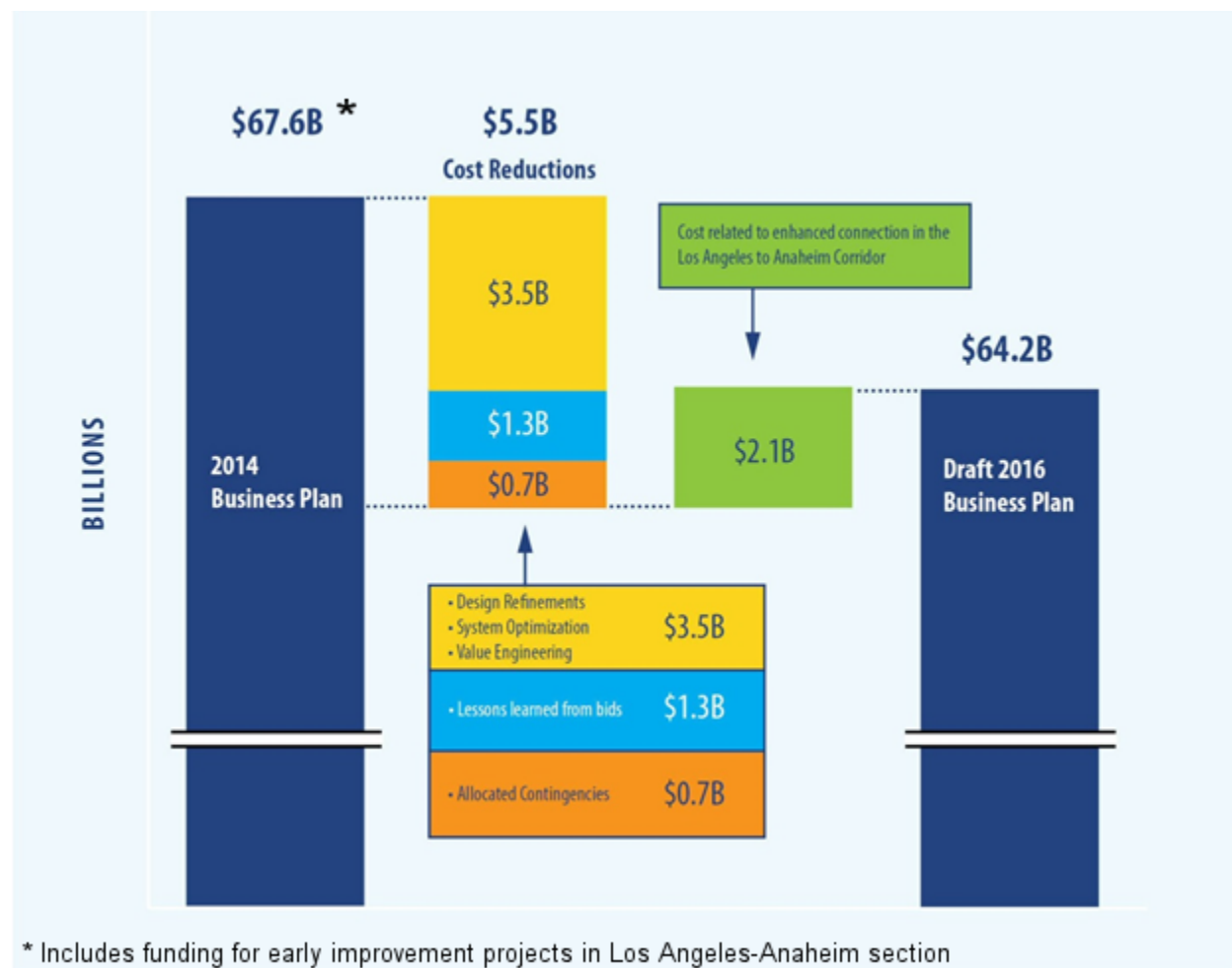
Figure 1 – Basis for Capital Cost Reductions (in billions of YOES)

Table 1 and Table 2 present the 2016 Business Plan capital cost estimates by the Federal Railroad Administration (FRA) Standard Cost Category (SCC) in both base year 2015 dollars and in year of expenditure dollars (YOES) for the Silicon Valley to Central Valley line and the Phase 1 system, respectively.