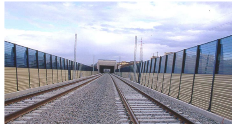
*Images serve as examples of noise mitigation measures and are not an indication of a preferred method for use on the California High-Speed Rail project