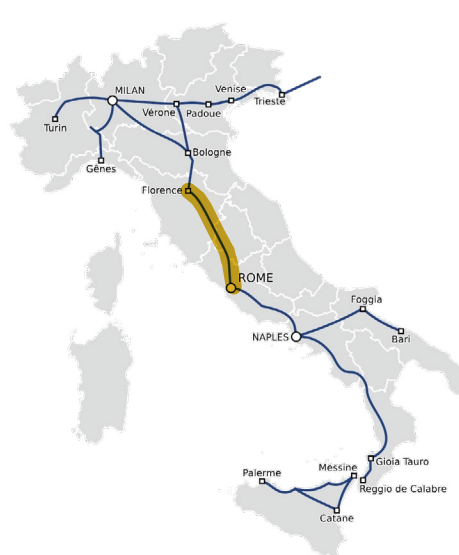
Florence - Rome 158 miles