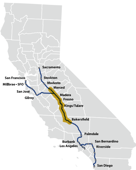
Merced - Bakersfield 171 miles