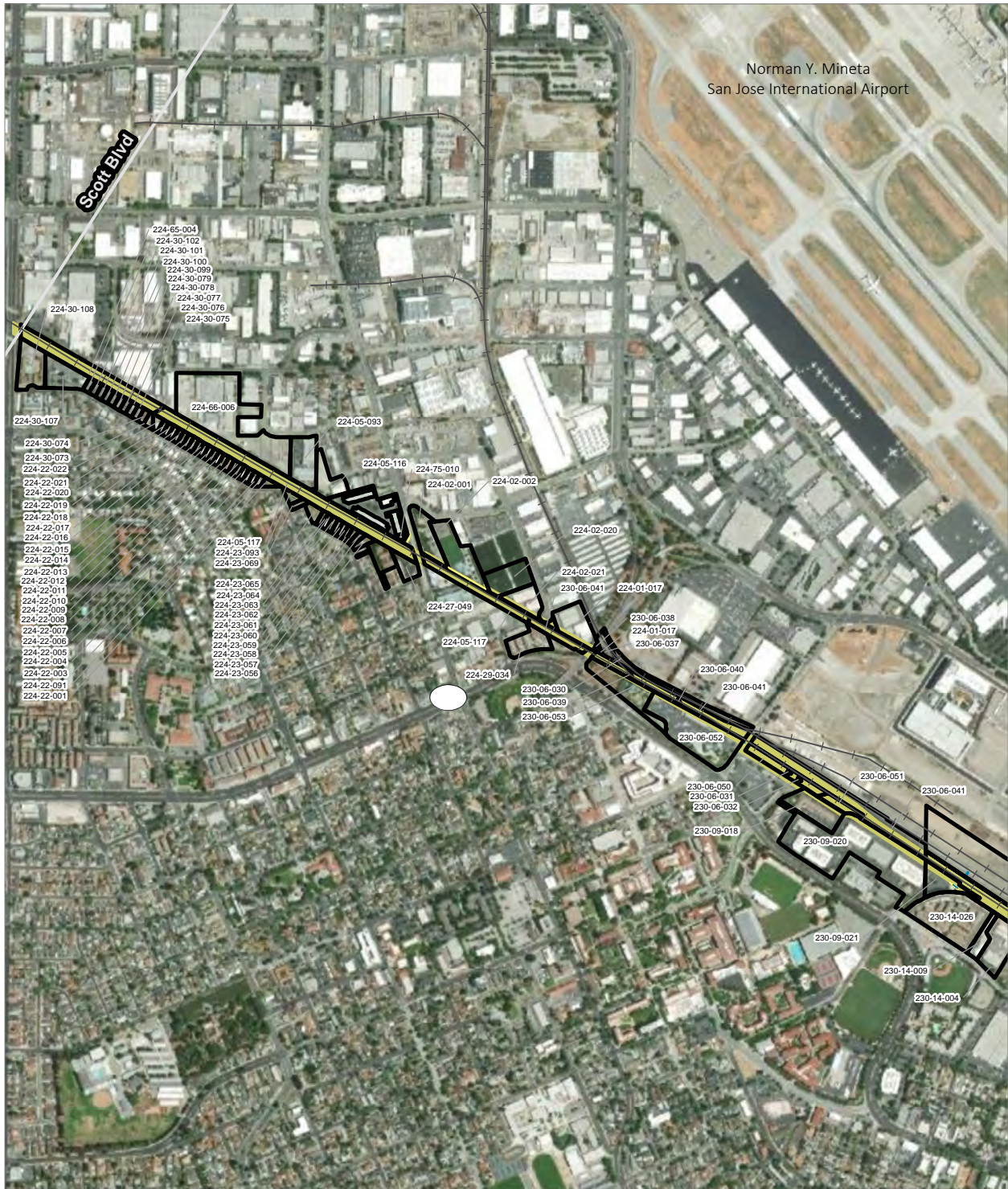
PRELIMINARY DRAFT/SUBJECT TO CHANGE - HSR ALIGNMENT IS NOT DETERMINED