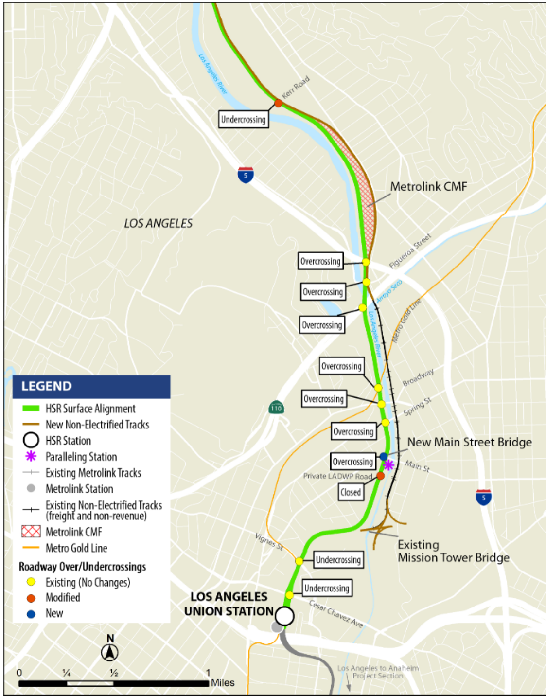
Figure 3 Burbank to Los Angeles Project Section—Los Angeles Union Station